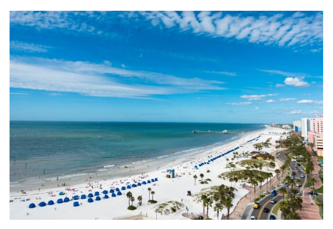
Another day in paradise, Clearwater Beach, Florida

Clearwater is known for its stunning beaches, abundant outdoor activities, and relaxed atmosphere, all of which contribute to employee satisfaction and a strong work-life balance. Clearwater Beach is consistently ranked as one of the top beaches in the country, attracting both locals and visitors from around the globe. The city's expansive biking trail system spans from the bay to the beach, with plenty of parks and recreation centers to explore, along with top-notch golfing and boating opportunities. The city is home to two marinas and a public boat ramp, offering connectivity to nearby islands.